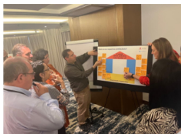
Participants engage in an activity establishing that we are stronger together.

Hosted by St. Jude Global and the World Health Organization Working Group on Palliative Care , the Global Action Forum for Palliative Care brought together leaders, experts and partners from 23 countries in Dubai on September 8. The event convened 42 participants from WHO Collaborating Centres, civil society and global organizations, each committed to strengthening leadership and coordination to expand access to palliative care for all people living with serious illness.