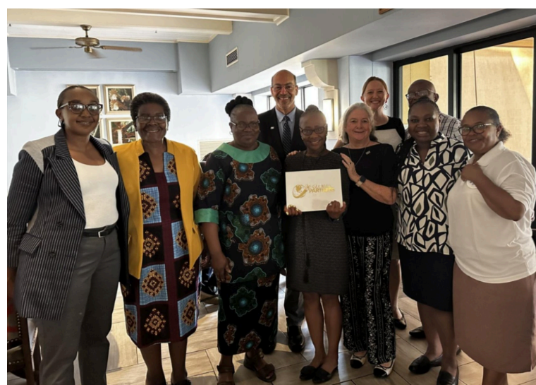
GPIC partners from Island Hospice and Healthcare in Zimbabwe receive certificate of appreciation from GPIC in honor of our 25th anniversary.

More than 40 participants – including GPIC partners, regional representatives and palliative care leaders from across Africa and around the world came together to refine, test and advance the project concepts that emerged from the May 2025 Dublin meeting . The workshop represented a key milestone in GPIC's ongoing efforts to foster collaboration, test ideas in diverse contexts and strengthen a global network united by a shared vision for advancing palliative care.