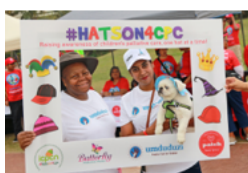
#HatsOn4CPC in South Africa

Every year, World Hospice and Palliative Care Day (WHPCD) unites the global community to champion universal access to palliative care. The 2025 theme, "Achieving the Promise: Universal Access to Palliative Care," calls on all stakeholders – governments, advocates, communities and families – to turn this promise into action. This year, a range of events and voices rose around the world, each contributing to the shared movement toward equity, dignity and care for all who face serious illness.