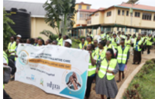
Walk for palliative care in Kenya

In South Africa, Palliative Care for Children South Africa (PatchSA) and Umduduzi Hospice Care for Children led a 5-kilometer Fun Walk along the Durban beachfront, encouraging participants to wear hats in solidarity with children needing palliative care.