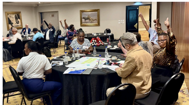
Participants enthusiastic about embracing the process of human-centered design.

Building on the momentum that began in Dublin with the Collaborating for Global Impact workshop earlier this year, Global Partners in Care (GPIC), in partnership with Elea Institute, brought the initiative to Botswana through a dynamic pre-conference workshop at the 8th International African Palliative Care and Allied Health Services Conference .