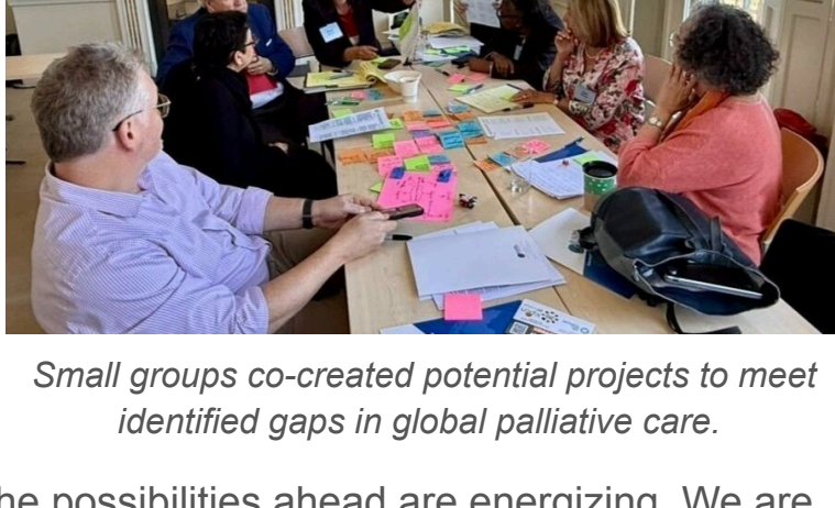
Small groups co-created potential projects to meet identified gaps in global palliative care.

The connections created at the workshop and the possibilities ahead are energizing. We are committed to continuing the momentum together in the coming months. It was an honor to gather with a wonderful group of leaders to share, learn and co-create. Thank you to all who participated! Your insights, honesty and participation made this gathering a success. We are more hopeful than ever for the future we are building together in global palliative care!