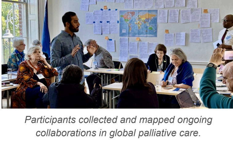
Participants collected and mapped ongoing collaborations in global palliative care.

The goal was to harmonize efforts and collaborate to amplify the impact of our work. Over two days, we reflected on the current global palliative care landscape, identified gaps and opportunities and co-designed ideas for collective action. Guided by expert facilitators from Humaniteria, the workshop used human-centered design principles focused on actionable next steps toward shared palliative care goals.