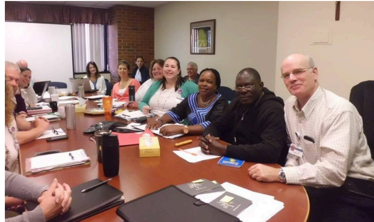
The Shirati palliative care team at a UPMC interdisciplinary team meeting.