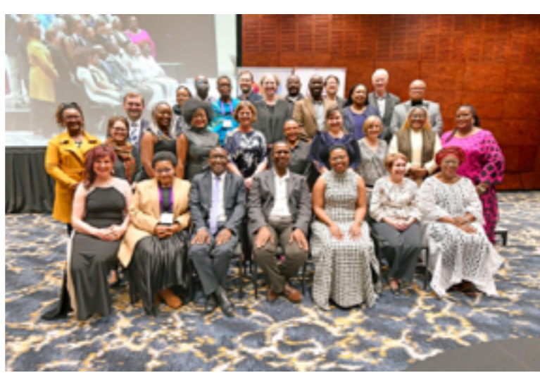
Group photo of the in-person attendees at the APCA celebration dinner on May 17, 2024