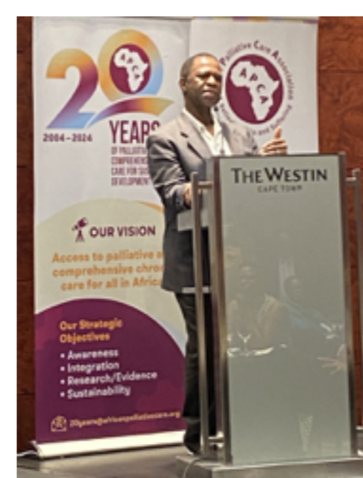
Deputy Minister of Health Dr. Sibongiseni Dhlomo delivers the keynote address at the APCA celebration dinner

The commemorative dinner was a hybrid event that allowed conference attendees and others around the world to celebrate for launch of APCA's 20-year anniversary. The keynote speaker of the evening was Dr. Sibongiseni Dhlomo, the deputy minister of health in South Africa.