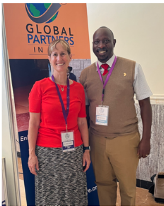
2022 APCA conference

I've been asked (more than once) if it's difficult to travel by myself to places where I know only a few people and don't speak the language. "Of course," I reply. There are always challenges. Jet lag and illness rank at the top (and I've experienced both on every trip I've made). But those pale in comparison to the relationships I've made on each of those trips. The palliative care community is filled with people whose hearts are as large as the African sky.