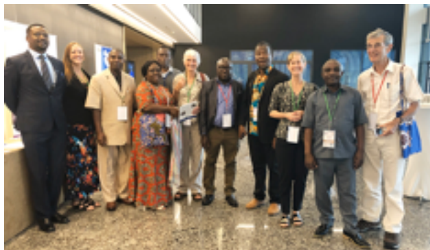
With Tanzanian partners in 2019