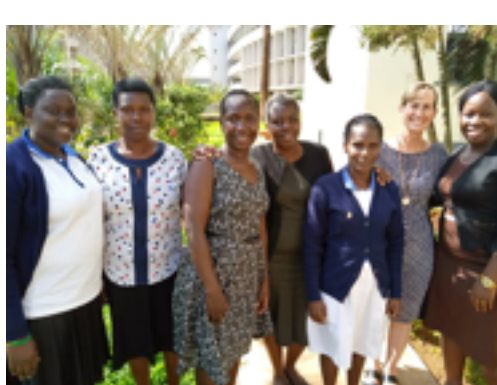
With palliative care nurses in Uganda