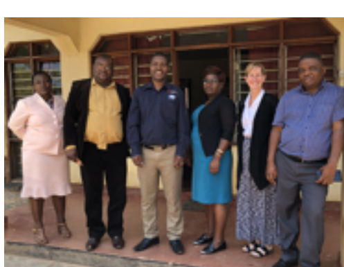
At the Palliative Care Association of Malawi

So please know that even though I am not involved in the day-to-day activities of Global Partners in Care any longer, I will carry with me the examples you have set through your hard work, your compassion, your dedication and most of all, your care. You will continue to be in my thoughts and prayers. You have made me a kinder, more thoughtful person and I thank you.