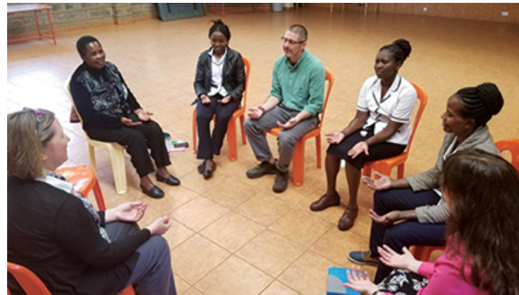
Caring Circle on an exchange visit to their partner, Our Lady's Hospice in Thigio, Kenya

Through our work with nearly 100 international partners and collaborators, we focus on supporting committed individuals and organizations working on the front lines in palliative care. Whether responding to patient and community needs in the wake of climate-related disasters – like the tropical storms and extreme heat experienced in Malawi earlier this year – or the lingering effects of the global pandemic, we are committed to continuing our support for our partners. By making grassroots connections, building relationships and collaborating with our colleagues in the broader international palliative care community, we advance innovative approaches to ensure continuity of care and support for the most vulnerable patients.