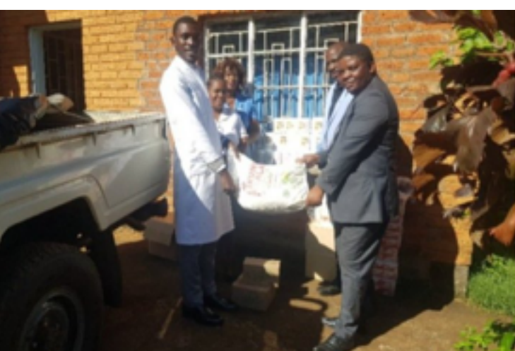
PACAM supplies emergency medicines to Mularnje District Hospital after recent floods

Global Partners in Care is able to further our mission because of the generosity of donors like you. Please consider giving to our 2023 Annual Appeal to help us support our partners and collaborators who provide palliative care throughout the circle of life.