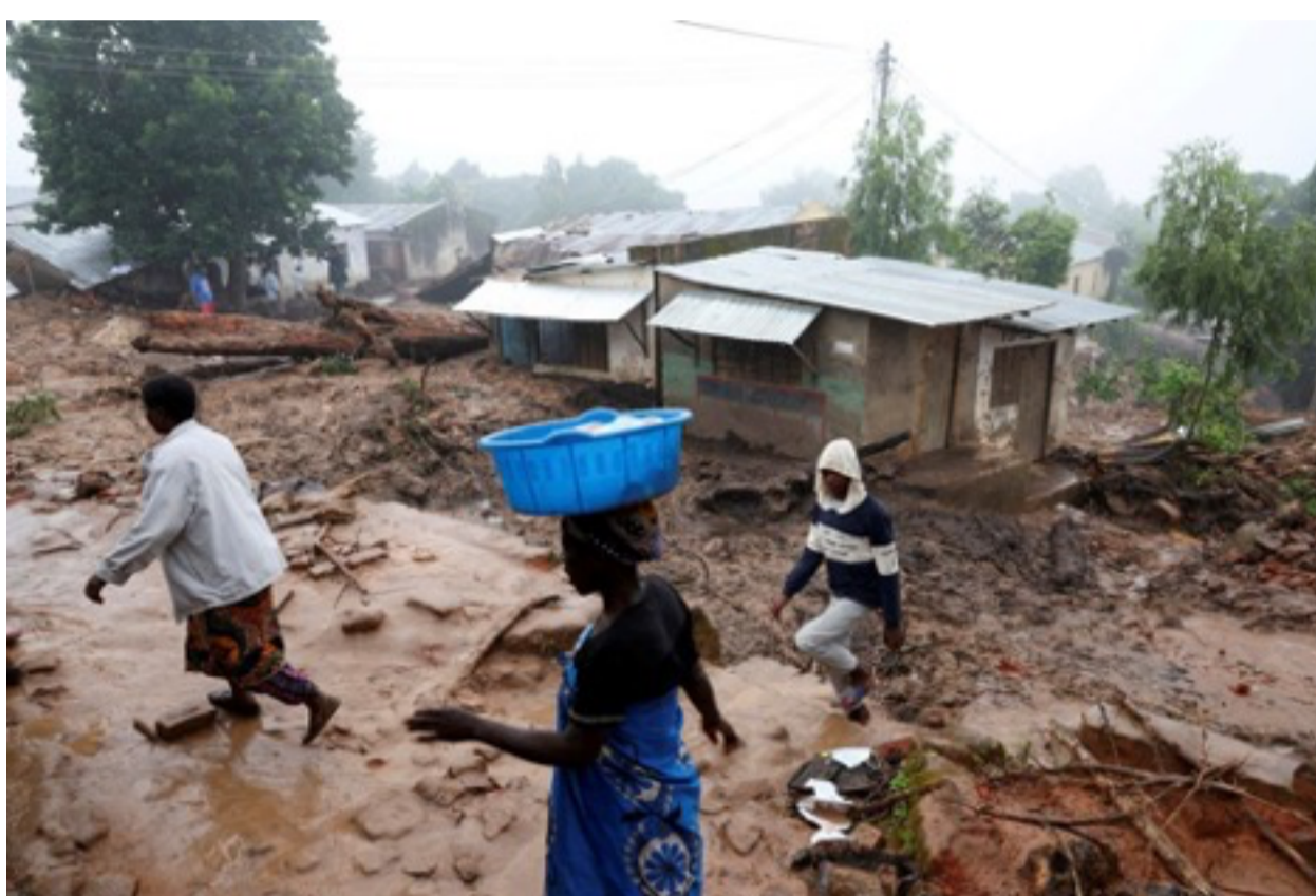
People walk past houses which were damaged in the aftermath of Tropical Cyclone Freddy in Chilobwe, Blantyre, Malawi, March 17, 2023.