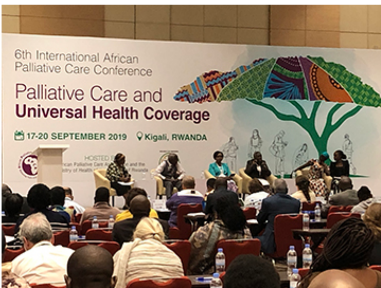
The 6th International African Palliative Care Conference was held in 2019 in Rwanda.