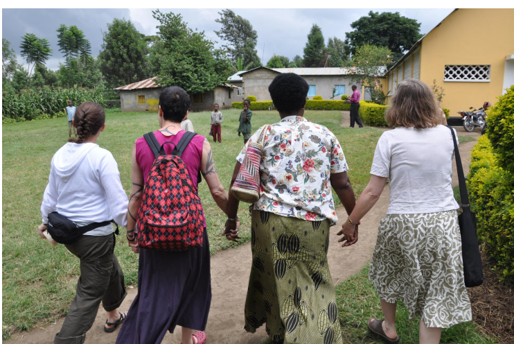
Partnership visits are an important aspect of building the relationship between partners.

• 23rd International Conference on Palliative Care – we also encourage you consider joining this international conference, which takes place October 18-21, 2022, in Montreal, Canada. More information is available here .