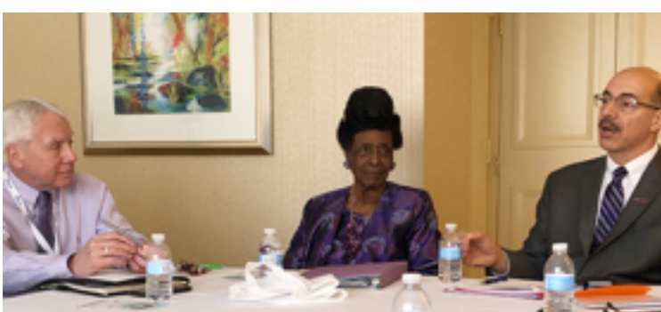
GPIC Advisory Council meeting at NHPCO's 2019 Leadership and Advocacy Conference.