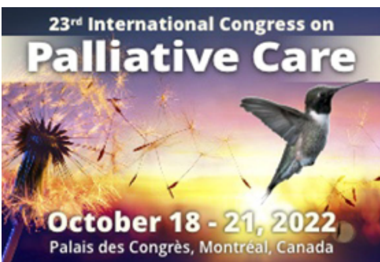
Poster for the 23rd International Congress on Palliative Care.

Finally, thank you for all you do to enhance access to palliative care around the globe. Because of you, patients in low-resource settings experience a better quality of living!