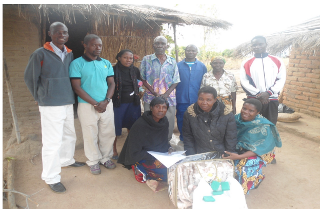
St. Luke's palliative care team delivering materials and providing care to patients after Cyclone Idai hit their community in 2019.