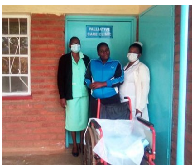
St. Luke's palliative care team in front of the new offices in May 2021.