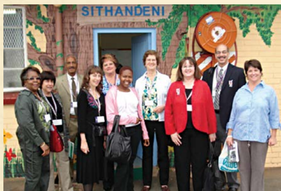
People to People delegation visits the International Children's Palliative Care Network