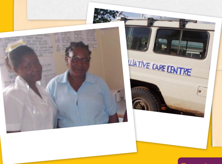
Pamodzi Palliative Care Centre