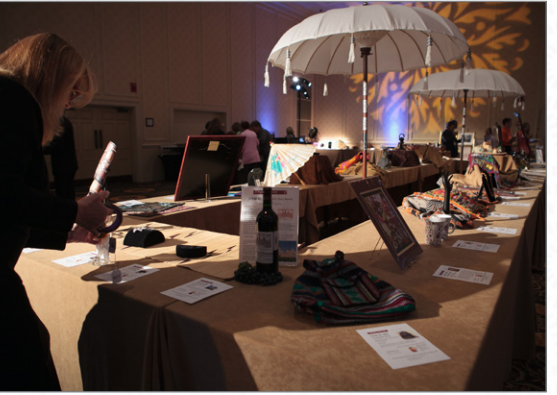
Conference attendee at the event's silent auction tables

Thank you to everyone who participated in A Night in Mumbai, our fundraising event to benefit the expansion of hospice and palliative care services to other parts of the world. Our first stop, India!