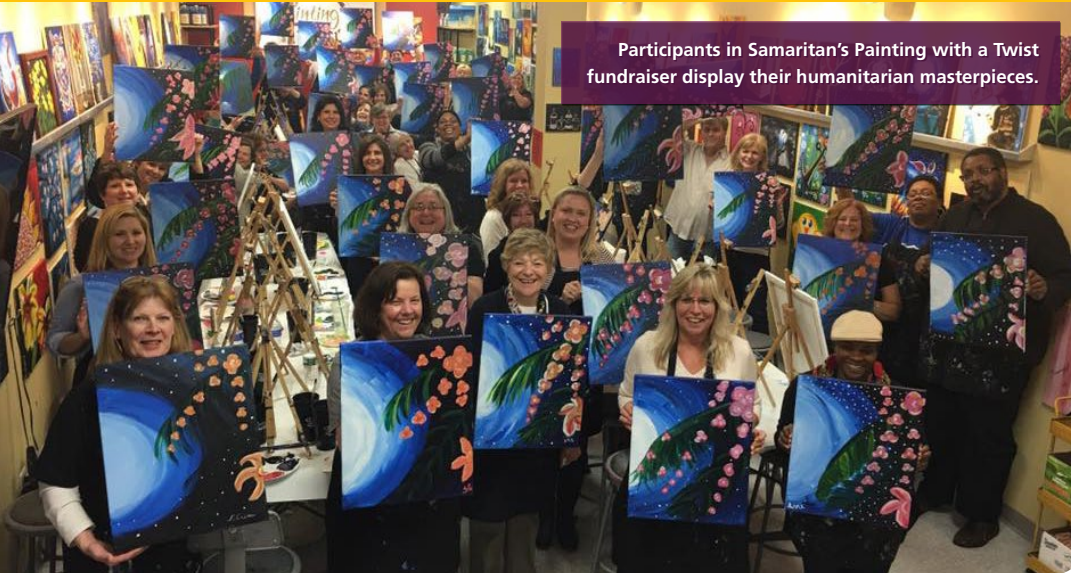
Participants in Samaritan's Painting with a Twist fundraiser display their humanitarian masterpieces.