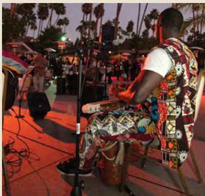
Guests enjoyed the sounds of Sené Africa at the From San Diego to Africa fundraiser.

W ith more than 200 guests and great San Diego weather, this year's FHSSA event at NHPCO's 12th Clinical Team Conference was a huge success. Conference attendees, board members, and special guests mingled, danced, and bid on the over 100 auction items, which included authentic African treasures and a safari trip in South Africa. The grand total of money raised to support FHSSA was $51,487.